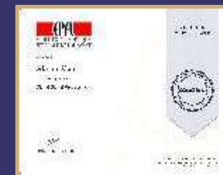
Akram Alam B.Tech. (ECE) Digital Signal Processing from Ecole Polytechnique Fédérale de Lausanne, Switzerland