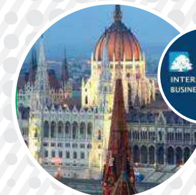
International Business School, Hungary